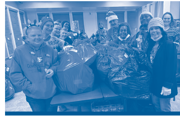
Covenant House staff and donors came together for the 2023 Adopt-A-Family effort.