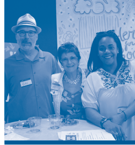
Here for Good 2023 at The Snack Institute, sponsored by McKinley Carter.