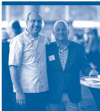
Chefs and patrons came together for the 13th Annual Chef's Challenge.

OUR 14TH ANNUAL CHEF'S CHALLENGE will take place on September 24, 2024 at the Charleston Coliseum & Convention Center. Join us for this one-of-a-kind, sellout event. Sponsorships and tickets information available later this year.