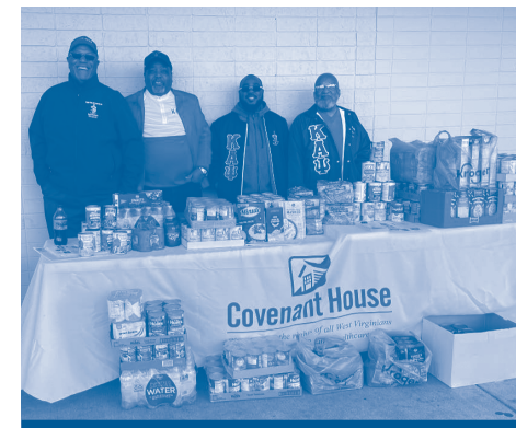
Charleston Alumni of Kappa Alpha Psi did a food pantry collection effort in October, 2023.