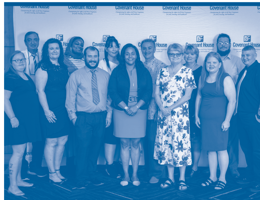
Covenant House staff attends the 2023 Chef's Challenge at Civic Center.