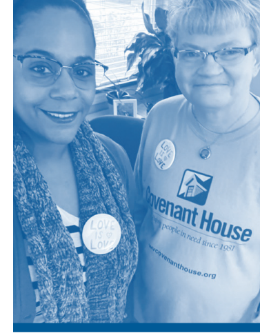
Covenant House distributed pins for Pride Month 2022.