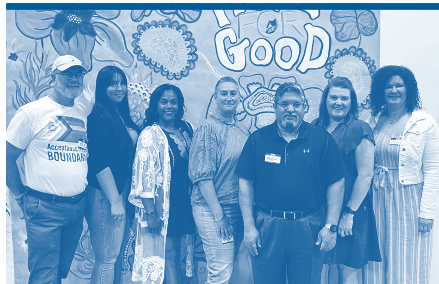
In June 2022, Covenant House staff attended the Here for Good party for our donors.