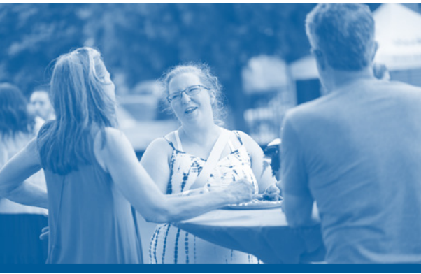
Donors attending Covenant House's 2024 Here for Good block party.