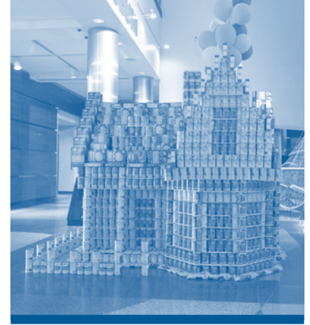
Sillings Associates' 2025 CANstruction entry.