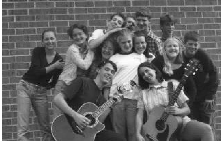
The cast of Echoes in the Hallway

thing called "Travel West Virginia," she said. "I don't take it, but I can't imagine anybody getting anything out of it."